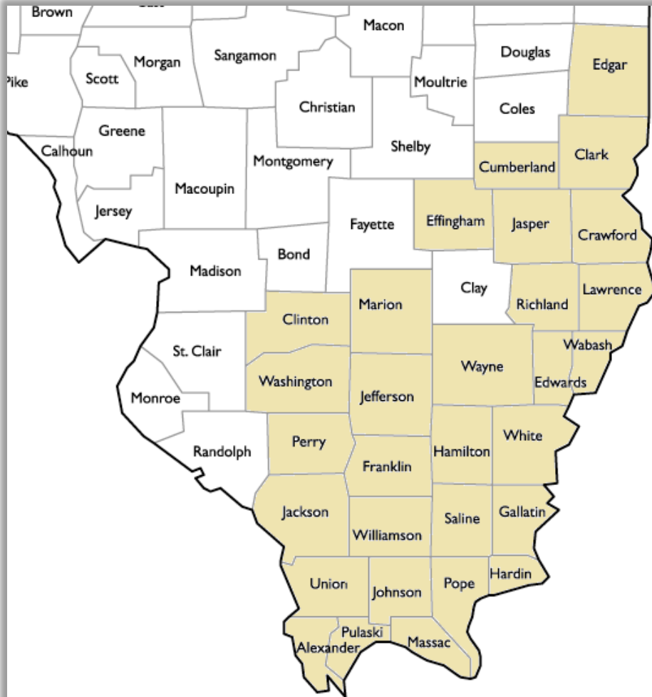
Multi Agency Transit Service Areas