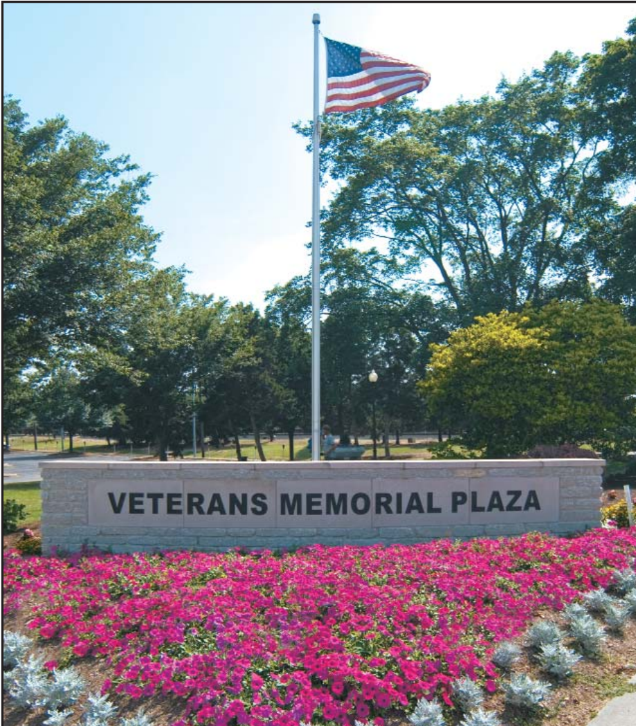
The Veterans of Foreign Wars Teeter-Carter-Watson Post 2605 worked with Carbondale Main Street to develop the Veterans Memorial Plaza Wall that designates the Veterans Memorial Plaza located on the southeast quadrant of the Town Square. The Veterans Memorial Plaza Wall was dedicated to the City of Carbondale in July of 2004 and stands in memory of the City's Veterans.